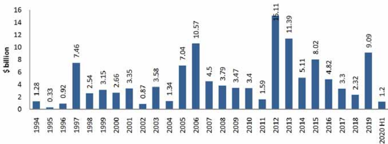
Trends in Private Investment in Africa

However, political instability remains one of the key challenges in the growth path of Africa. The policy landscape, especially that related to infrastructure is still at a nascent stage. Besides, the PPP framework is still evolving and fraught with several challenges. As per industry experts, inadequate availability of funds for project development and preparation renders projects unviable. Across African countries, the COVID-19 pandemic has highlighted structural gaps in national health care systems, corruption risks associated with public procurement and the misappropriation of emergency funds.