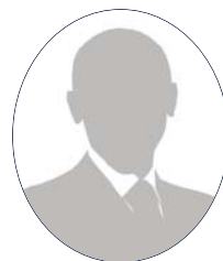
SENIOR REPRESENTATION Ramboll